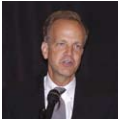
▲ Jerry Moran (R-Kan.)

H.R.971, the Community Pharmacy Fairness Act of 2007, would create a narrow exemption to current antitrust law that would allow non-publicly held community pharmacies to form groups to negotiate contracts with PBMs as well as Medicare Part D plans.