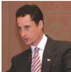
▲ Anthony Weiner (D-N.Y.)

One of NCPA's top legislative priorities in the 110th Congress, a measure that would break the stranglehold PBMs' all or nothing contracts have on independent community pharmacy, has been introduced in the House and we expected a companion Senate bill to follow soon. Once again, Reps. Anthony Weiner (D-N.Y.) and Jerry Moran (R-Kan.) are the chief sponsors of this business negotiation rights legislation in the House. In the last Congress, more than 100 of their colleagues signed on as bipartisan cosponsors, but the legislation was stymied by House Republican leaders and the giant PBMs.