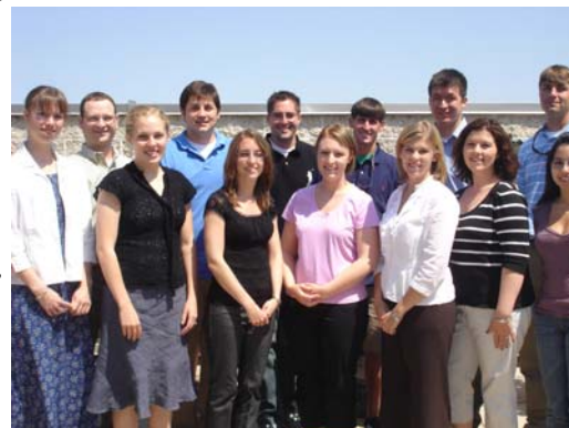
The NCPA Student Executive Committee looks forward to seeing you in Anaheim this October!

These are just a couple of things you and your chapter can get excited about! There will be recognition for the chapters who are top performers in each of these projects, and remember, participation in these projects will glow on your Chapter of the Year applications!