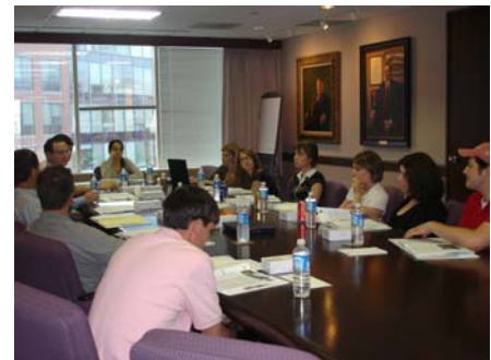
Student Executive Committee members hard at work discussing student programming and projects for the 2007-2008 year.