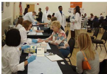
Ohio Northern University Lipid Panel Screening

THE DEADLINE IN AUGUST 1 ST , SO DON'T WAIT!!!