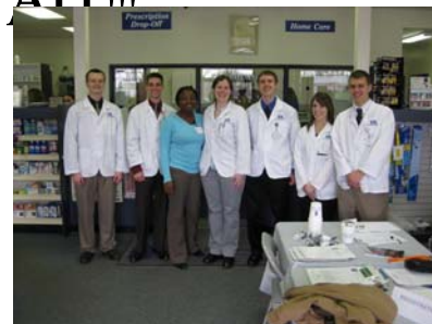
University of Kentucky Capitol Pharmacy Health Fair