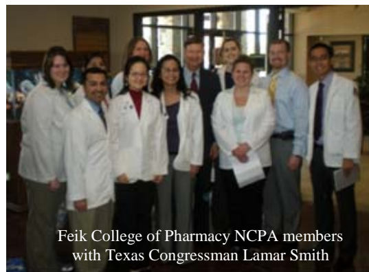
Feik College of Pharmacy NCPA members with Texas Congressman Lamar Smith

http://www.ncpanet.org/studentsvcs/index.php