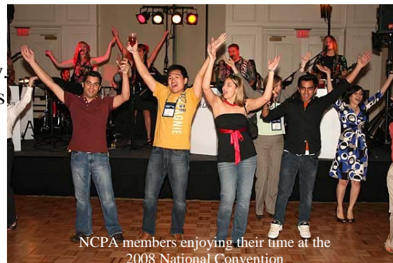
NCPA members enjoying their time at the 2008 National Convention

NCPA provides students with the resources and know-how to buy and run a successful community pharmacy. Unlike other professional associations that focus only on the clinical side of pharmacy, NCPA gives you the business and advocacy skills to compliment your clinical expertise. Membership provides you with valuable insights into the professional challenges and opportunities of independent ownership so when you're ready to take control of your career, you can!!!